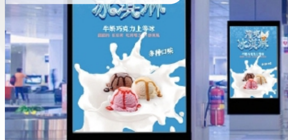
Advertising Light Boxes